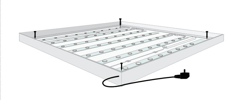
WALLMOUNT Easy wallmount by drilling the dibond.